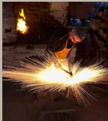
Watch a sculpture being created live by Bringsty Forge Blacksmiths